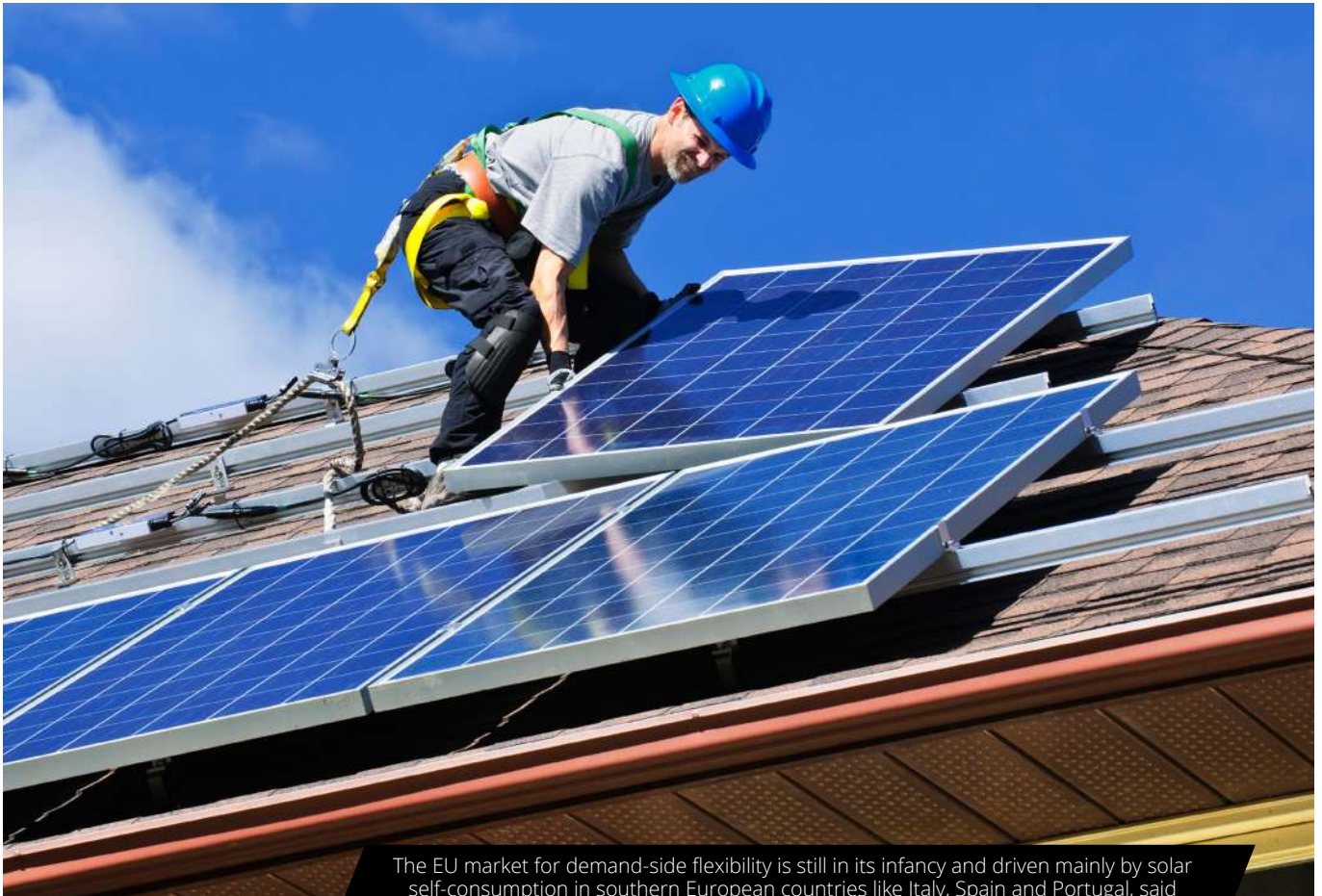
The EU market for demand-side flexibility is still in its infancy and driven mainly by solar self-consumption in southern European countries like Italy, Spain and Portugal, said Lucinda Murley, a senior analyst at consulting firm LCP Delta.

A s Europe shuts down its remaining coal power plants and turns away from volatile gas for electricity generation, it is also losing key flexible power supplies that can be switched on at the last minute to keep the lights on during peak hours.